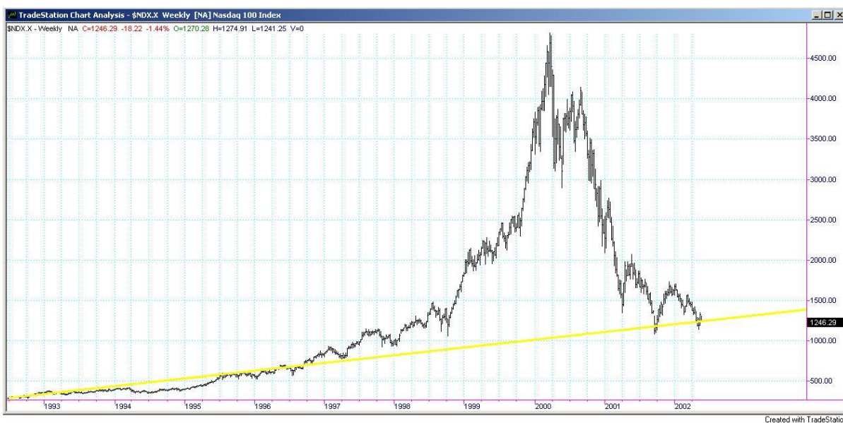
Figure 2—The NASDAQ Over the Very Long Term (since 1993)

But, what if you weren't around in 1982? Or, what if you weren't interested in trading at that time in history? Chances are you heard about trading as the bubble expanded in the dot-com boom, and you fell into the clutches of one of the purest motivations for trading: greed. Two emotions rule the markets—fear and greed—and these two emotions come heavily into play at market tops and bottoms. So, for purposes of examining the question (to trade or not to trade) let's say you decided to be come a trader on January 1, 2000.