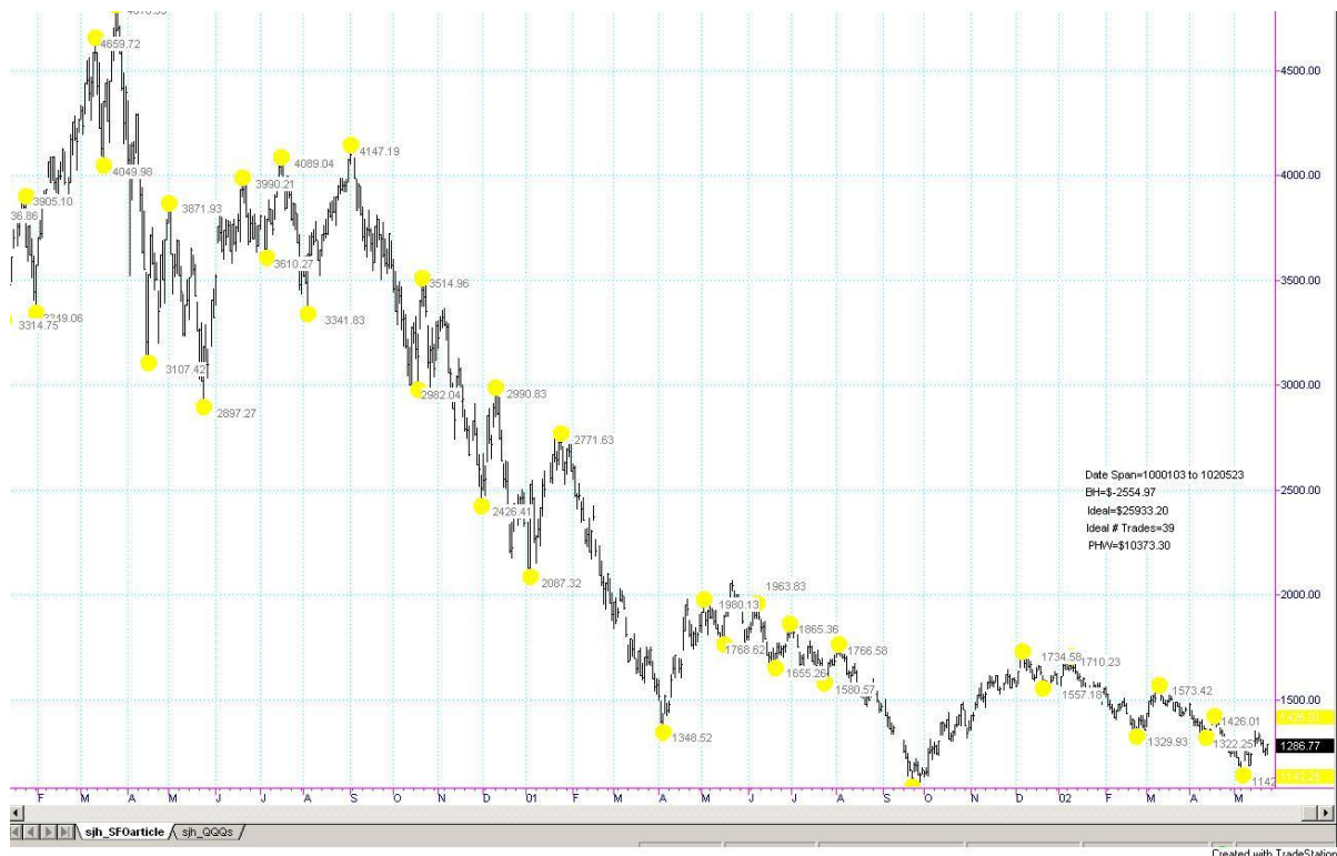
Figure 3—PHW™ calculates the ideal maximum possible profit

But, as traders we need to know: is there any way to negotiate around in a bear market and not lose your shirt? The answer, of course, is yes, if you traded from both the long and short sides on the way down, or if you were psychic and went short at the top and were still holding your short position. As a more practical solution, I mark important pivot points with a yellow highlighter and then calculate the potential profit from each long and short position. (Actually I created an indicator that I call PHW and it automatically does the calculations, because I got tired of doing it by hand.) Knowing that it would be impossible to catch all the turning points, we need to take a practical percentage of the ideal and work with that lesser goal. Over the years I have found that it is possible to achieve 40% of the ideal, but rarely more. So that's the figure I use for PHW—40% of the ideal.